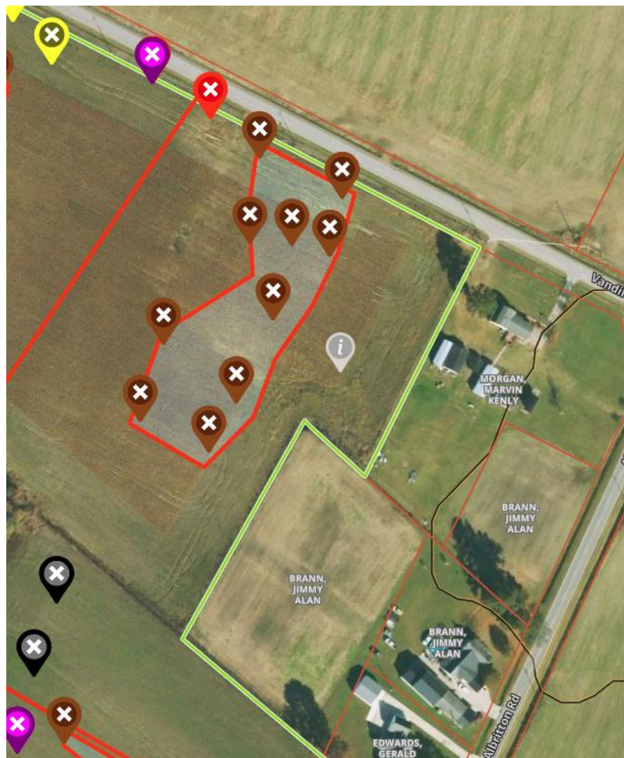
Figure 3. Soil boring locations within the lot as located by the onX Hunt application.

Over 13 soil borings and observations were advanced on the parcel as seen in figure 3 below. Their depths of suitable soils categorized the soils: the red dots represent suitable soils to 30 inches and were the Norfolk Soils; the brown dots represent suitable soils to 20" and were the Goldsboro (figure 3) soils. The recommended LTAR (long term acceptance rate) for the Goldsboro soils are 0.3 gallons per day per foot squared (GPD/ft 2 ). The yellow dots represent soils that were suitable to 18–19" and the purple dot was soils that were 13–17" to a seasonal high-water table (SHWT). The black dots are soils <12 to the SHWT.