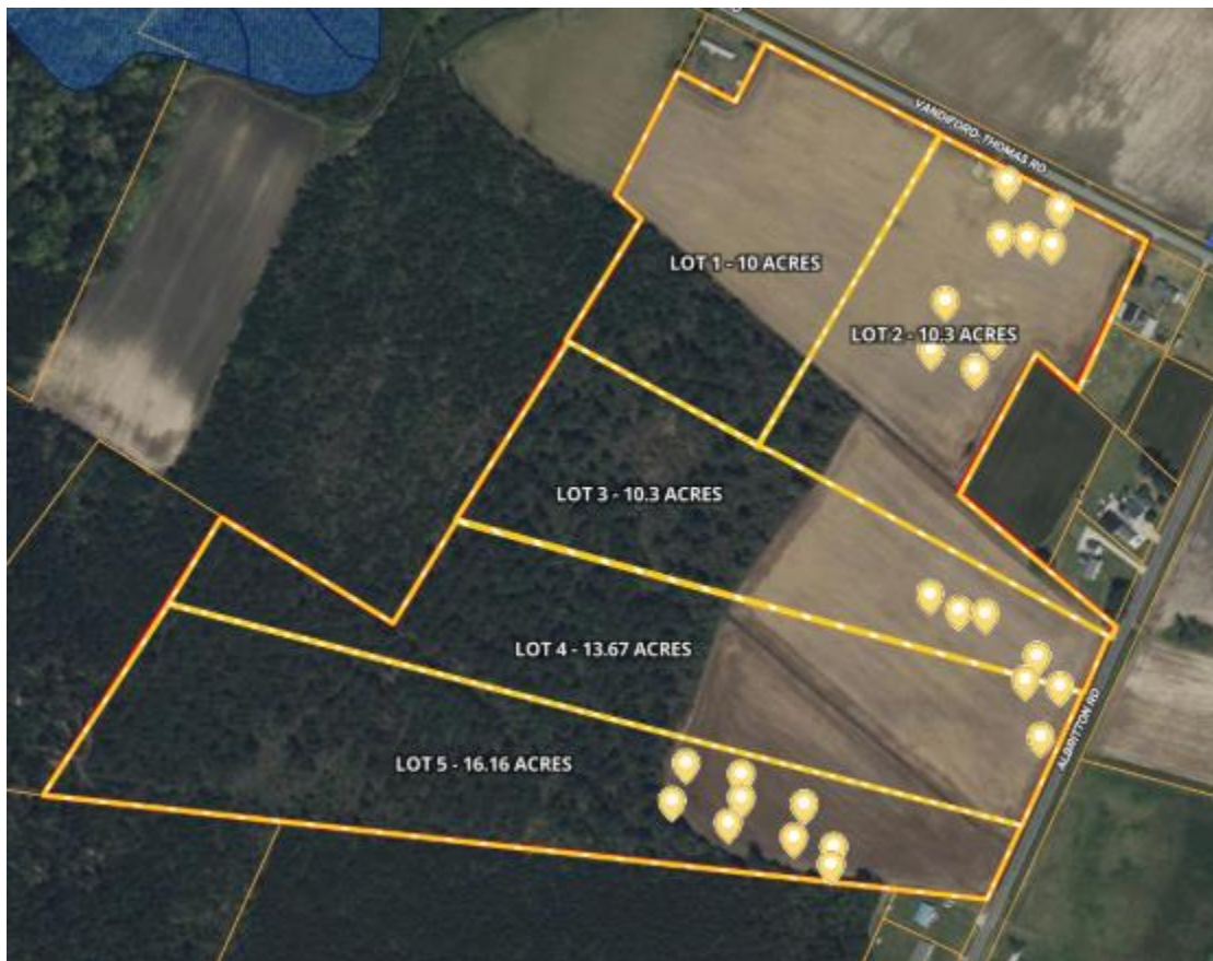
Figure 1. Property Location (Lot 2)

This report is intended to aid the permitting authority to evaluate the site.