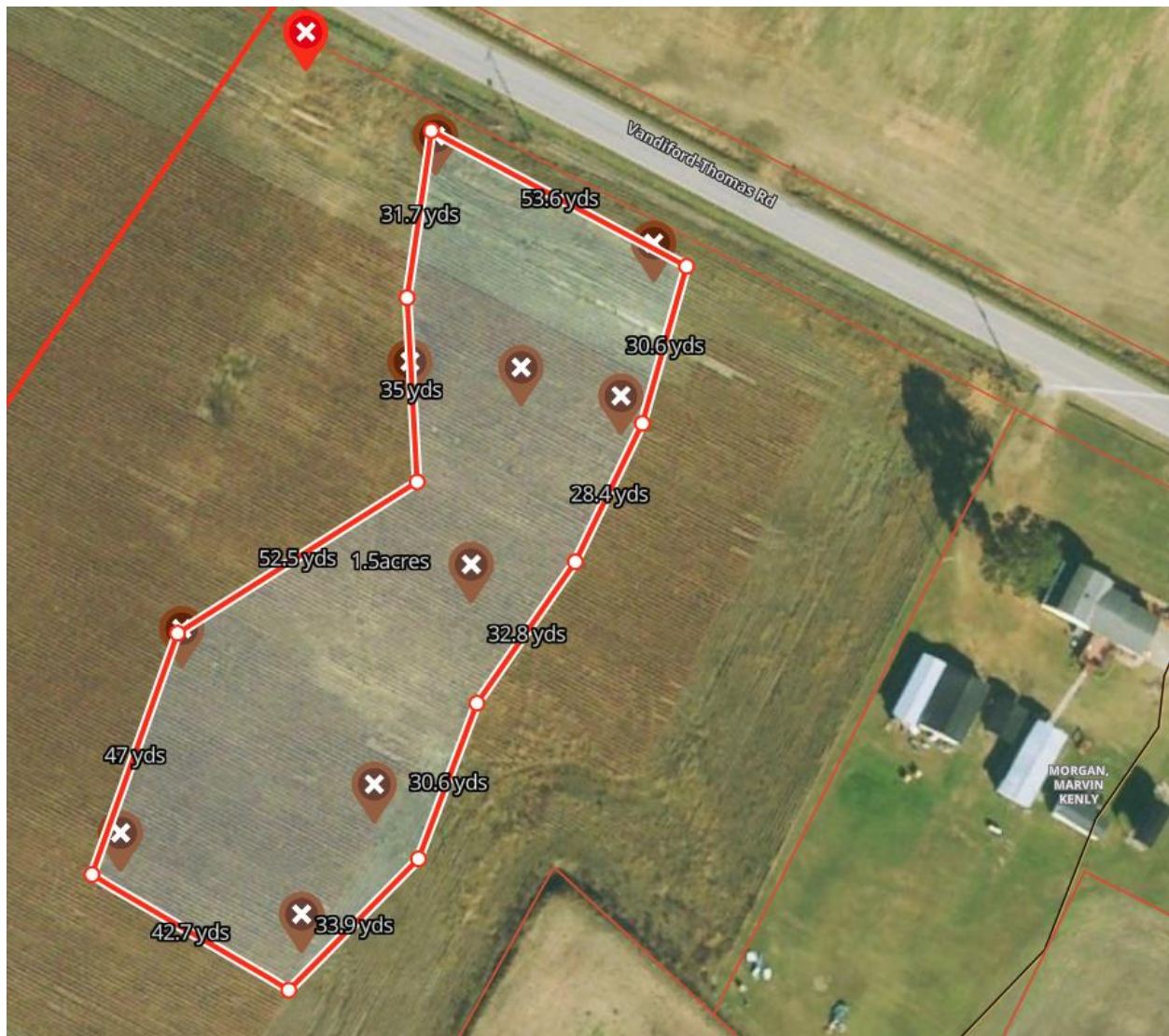
Figure 4. Usable soil area

The usable soil area was near the road frontage of the property (see figure 4 below). It was located on a narrow upland ridge that was surrounded by concave areas and subtle drainageways on both sides. It was 1.5 acres or 65,340ft 2 in size. This area is 4 times the needed space for a drainfield and repair area servicing a four-bedroom property.