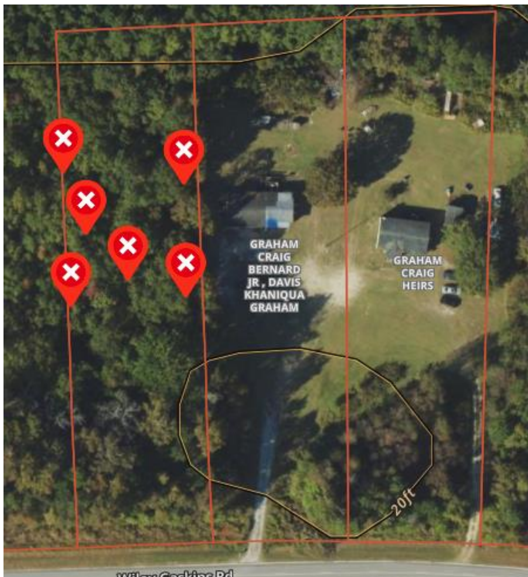
Figure 3. Soil boring locations within the lot as located by the onX Hunt application.

Over 6 soil borings and observations were advanced on the parcel as seen in figure 3 below. Their depths to suitable soils categorized the soils: the red dots represent suitable soils to 30" and were the Lakeland (figure 3) soils. The recommended LTAR (long term acceptance rate) for these soils are 0.6 gallons per day per foot squared (GPD/ft 2 ).