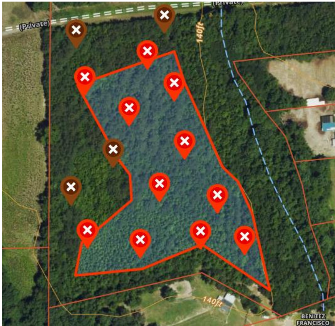
Figure 5. Usable area 2 on the parcel, south of Ricks road.

Area 1 north of Ricks Road is 3.32 ac in size (144,619 ft 2 ). The area in red shown in figure 5 below is 30 times the minimum needed area for a primary and reserve drainfield to service a 4- bedroom dwelling.