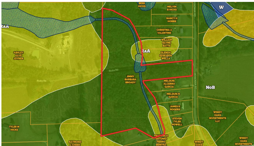
Figure 2. Soil map of the of the subject property.

The parcel lay in the upper Coastal Plain physiographic province. The soil map (figure 2) shows two soils mapped on the property: Norfolk and Rains. The Rains soil is not suitable for any septic system. Norfolk soils are typically suitable for conventional septic systems.