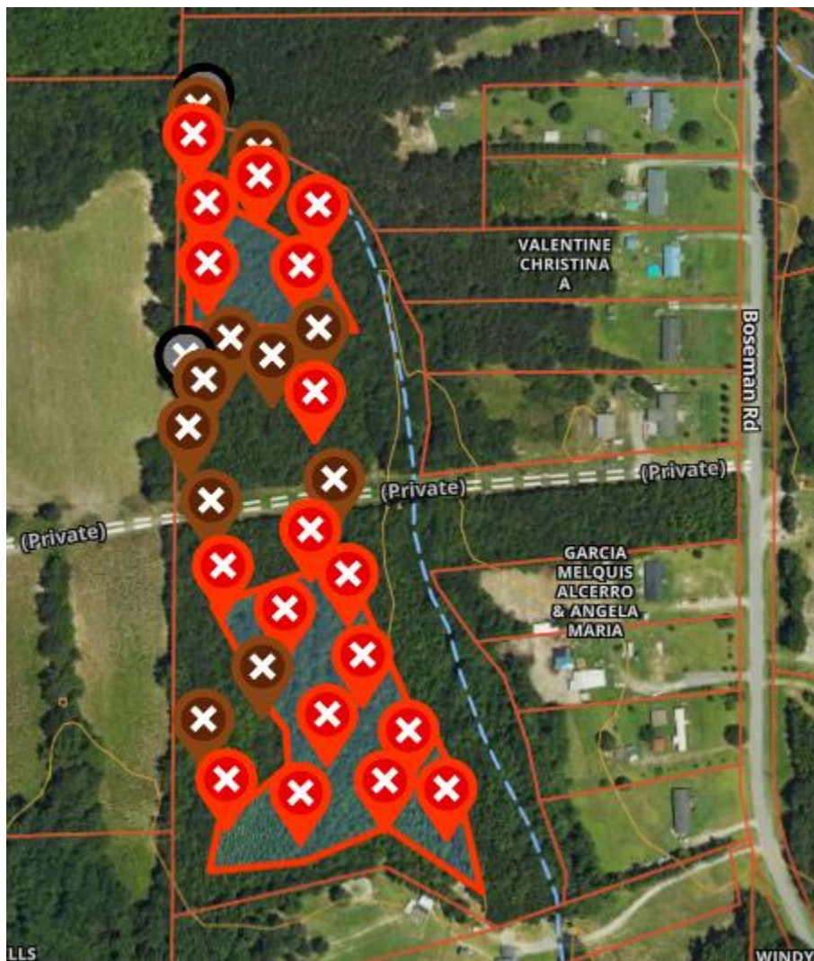
Figure 3. Soil boring locations within the lot as located by the onX Hunt application.

Over 31 soil borings and observations were advanced on the 16-acre parcel (figure 3). Their depths of suitable soils categorized the borings. The red dots were suitable soils to 30" (in ground conventional septic system). The recommended loading rate (LTAR) Norfolk soils are 0.4 gallons per day per square foot (GPD/ft 2 ). The brown dots were the Goldsboro soils (suitable soils to 24"). The black dot was the Rains soils (unusable).