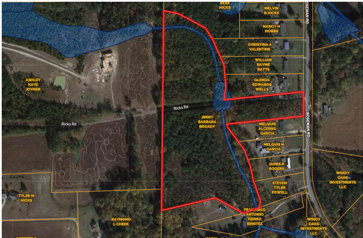
Figure 1. Property Location (16 acres)

This report shows the findings of a preliminary soil and site evaluation of the referenced parcel in Nash County, NC. The report shows that there were two areas of provisionally suitable soils found on the property. The soil and site conditions were suitable for the installation of an in-ground conventional system. This report is intended to assist the permitting authority pursuant to citing onsite wastewater systems. All applicable setbacks must be maintained.