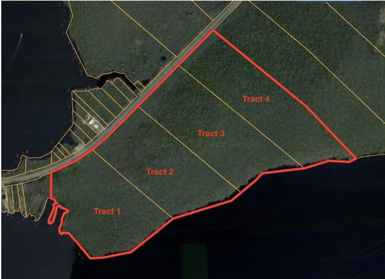
Exhibit A 320 acres Backwoods Land Company Camden County, NC

Tract #1 Pin# 028923006904960000 Tract #2 Pin# 028924007022840000 List Price $79,900.00